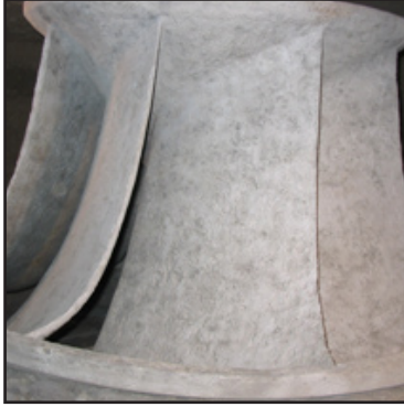
After grit blasting