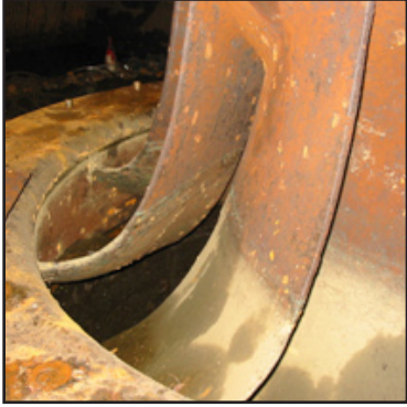
Damaged and worn runner