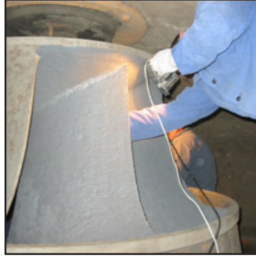
Rebuilding with Belzona® 1111