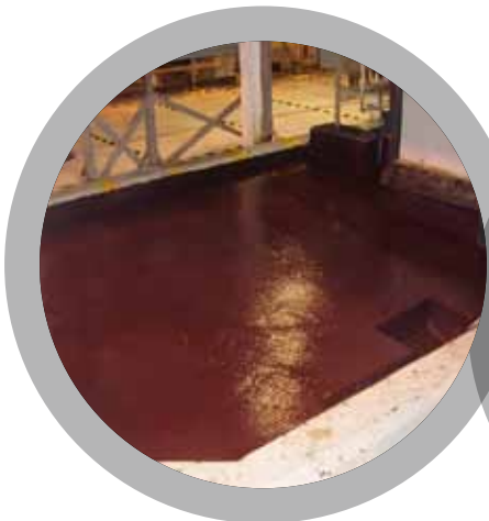
Chemical Containment Areas