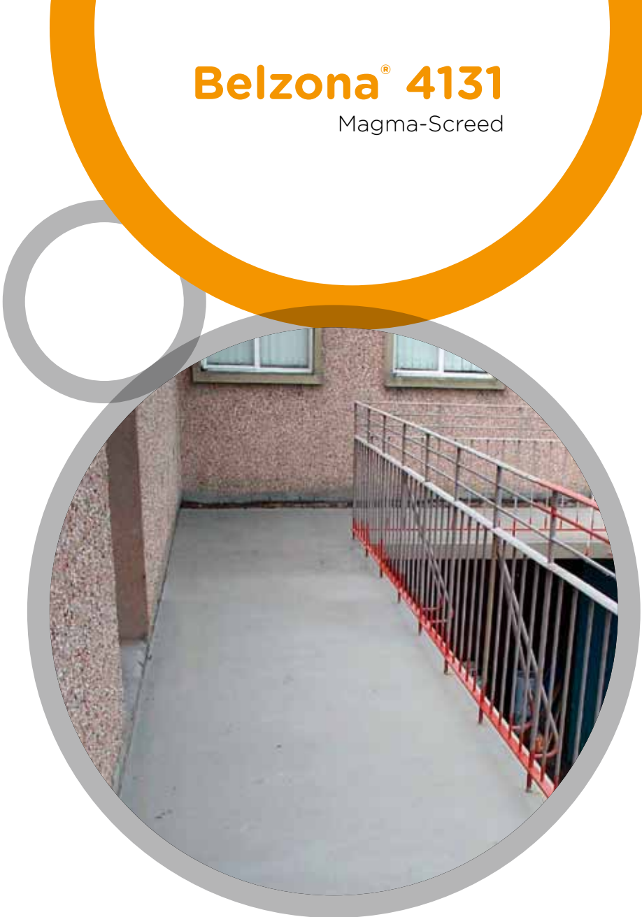
Floors and Walkways

For more information, please contact your local Belzona representative.