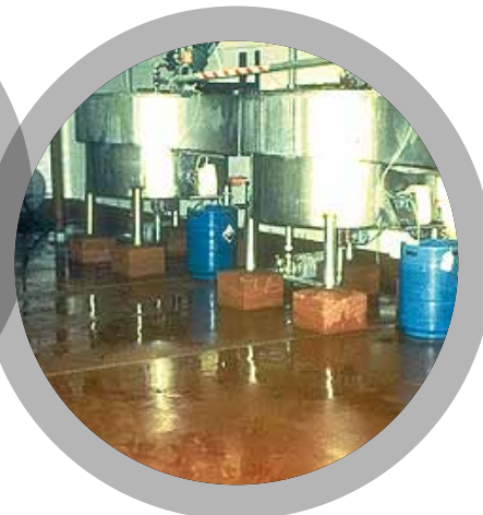
Machinery Production Areas