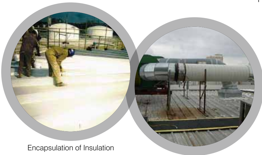
Encapsulation of Insulation