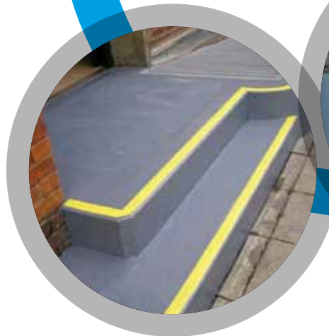
Entrance and Walkways