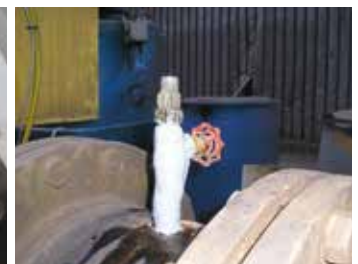
Leak sealing of pipework

For more information, please contact your local Belzona representative: