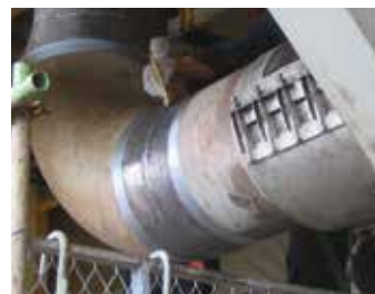
Repair to welds