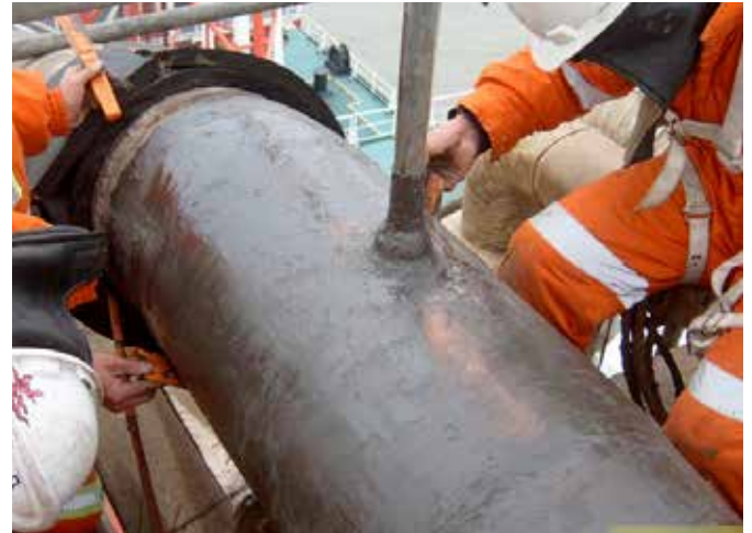
Oil and hot water pipeline repair

The material can be applied in-situ to live equipment operating at high temperature with minimal surface preparation. Belzona 1251 is a single pack system with no weighing or mixing are required.